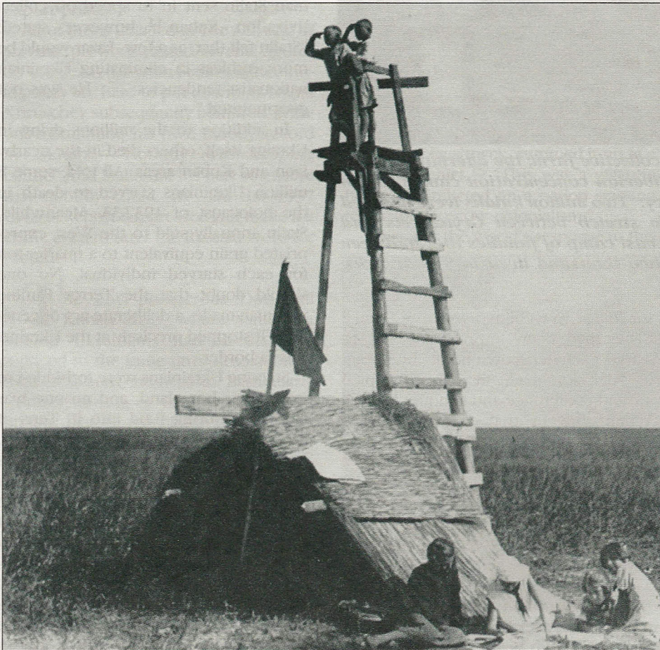
One of the watch towers built in fields throughout Ukraine farm regions during Stalin's starvation holocaust. Party activists, such as the Young Pioneers seen in this photo, kept on the lookout for "snippers"; people attempting to gather ears of corn. Any peasant caught with stored grain was treated as a kulak. This meant the family would be shot or deported to slavery in Siberia.

"Collectivization" meant herding all agricultural workers into a kolkhoz or collective farming complex, where the state would own everything and tell them what to do. Stalin's first and terri-