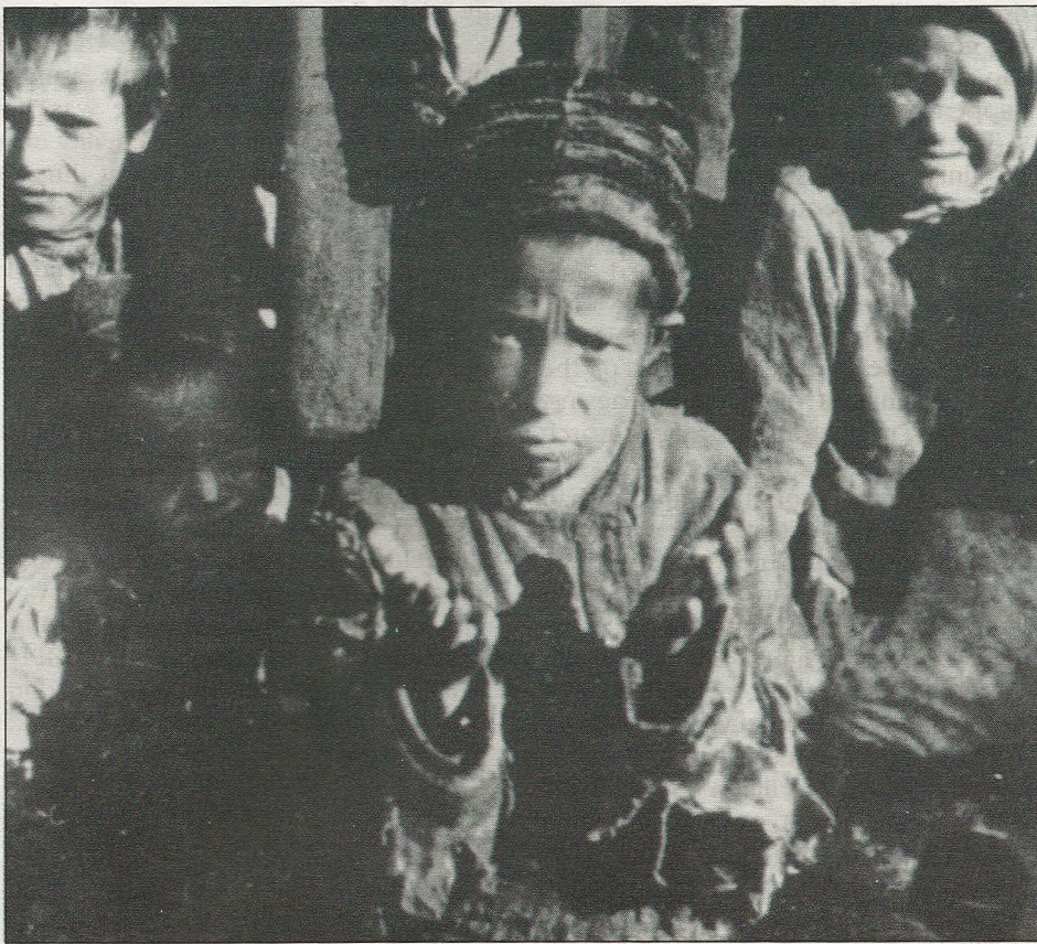
This emaciated Ukrainian boy appears to be begging for the most basic mortal necessity—food. A Communist party functionary wrote: “Starvation had wiped every trace of youth from their faces, turning them into tortured gargoyles.” The author Arthur Koestler observed that party-controlled Ukrainian newspapers ran pictures of healthy smiling children while “skeletons tottered in the streets.”

Wasył Hryshko’s The Ukrainian Holocaust of 1933 2 was published in 1983, and Miron Dolot’s Execution by Hunger: The Hidden Holocaust 3 in