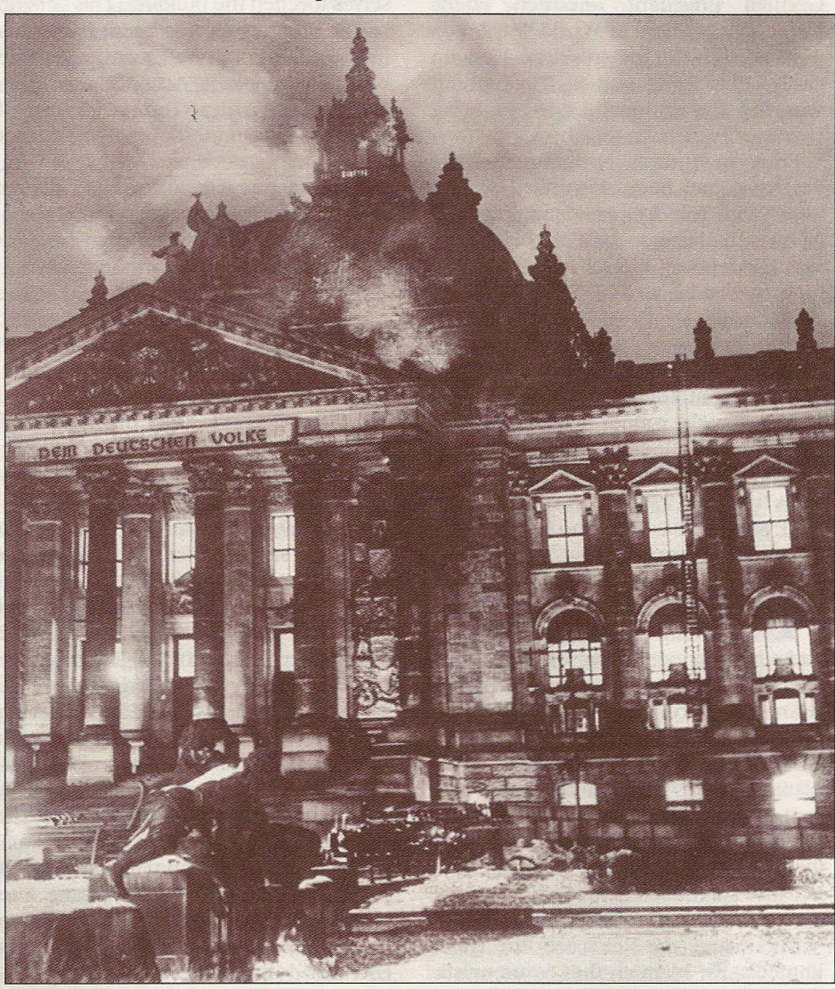
The German Reichstag or Parliament Building, is shown after a disastrous fire on February 27, 1933.

According to Leon Degrelle: "Germany was experiencing near-famine conditions. It was at this moment the